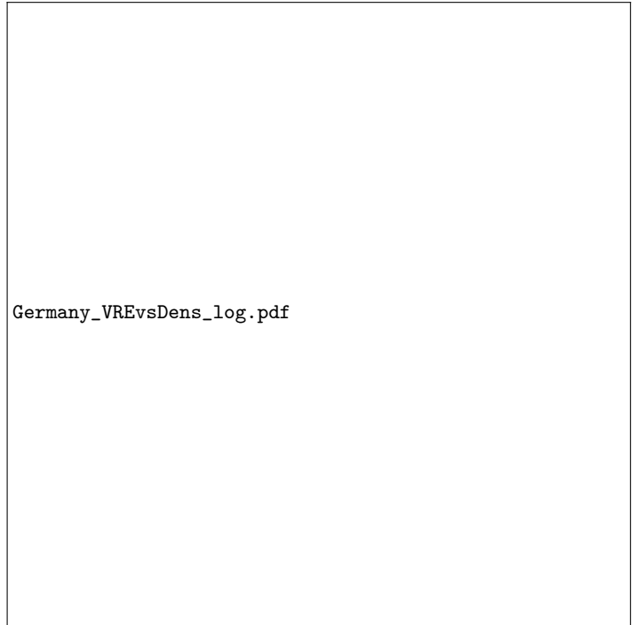
Fig. 1 Installed VRE capacity per capita vs the population density, in the different German states (2015). The blue line results from (3) with the best estimate for b , the light blue band stands for an error of \pm standard deviation in b Data source: Germany Renewable Energies Agency.

sity worldwide. To examine this point, Fig. 4 presents the population density versus VRE data for 131 countries (some are cut out). In this figure it can be seen that indeed at this stage no country is crossing the German b_c = 0.27 \text{ W/m}^2 line. The countries closest to the line, as of 2015, are Belgium with power density of 0.174 \text{ W/m}^2 , Denmark with 0.137 \text{ W/m}^2 , and Italy, Japan and UK with around 0.1 \text{ W/m}^2 . The rest of the world is lagging far behind.