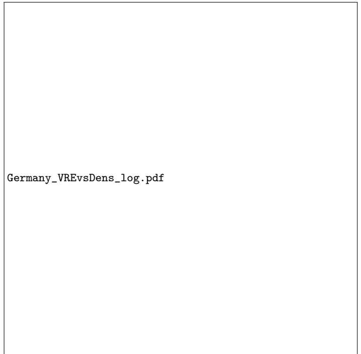
Fig. 1 Installed VRE capacity per capita vs the population density, in the different German states (2015). The blue line results from (3) with the best estimate for b , the light blue band stands for an error of \pm standard deviation in b Data source: Germany Renewable Energies Agency.

sity worldwide. To examine this point, Fig. 4 presents the population density versus VRE data for 131 countries (some are cut out). In this figure it can be seen that indeed at this stage no country is crossing the German b_c = 0.27 \text{ W/m}^2 line. The countries closest to the line, as of 2015, are Belgium with power density of 0.174 \text{ W/m}^2 , Denmark with 0.137 \text{ W/m}^2 , and Italy, Japan and UK with around 0.1 \text{ W/m}^2 . The rest of the world is lagging far behind.