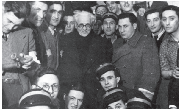
Mordechai Chaim Rumkowski, Chief of the Judenrat (center), among Jewish policemen, Lodz, Poland.

Mordechai Chaim Rumkowski. Before the war, Rumkowski had been a junior member of the Jewish community administration in Lodz. Like many other Jewish leaders during the Holocaust, Rumkowski found