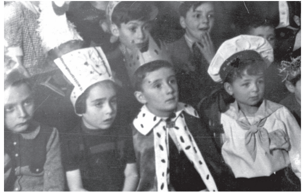
Children Celebrating Purim in the Ghetto, Lodz, Poland.

The ghetto continued to exist for two more years. Work was the focal point of ghetto life. The populace was desperately hungry and food could be obtained only through work.