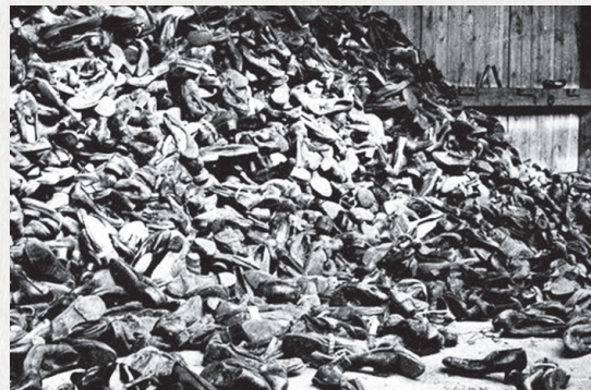
A pile of victims’ shoes, Majdanek, Poland.

AFTERWARDS, YOU MUST GO TO THE SHOWERS COMPLETELY NAKED.