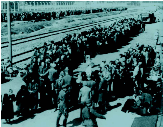
Jews undergoing the selection process on the Birkenau arrival platform known as the "ramp." The people in the background are on their way to Crematorium II, Auschwitz-Birkenau.

"Over there. Do you see that chimney over there? Do you see it? And the flames, do you see them?" (Yes, we saw the flames.) "Over there, that's