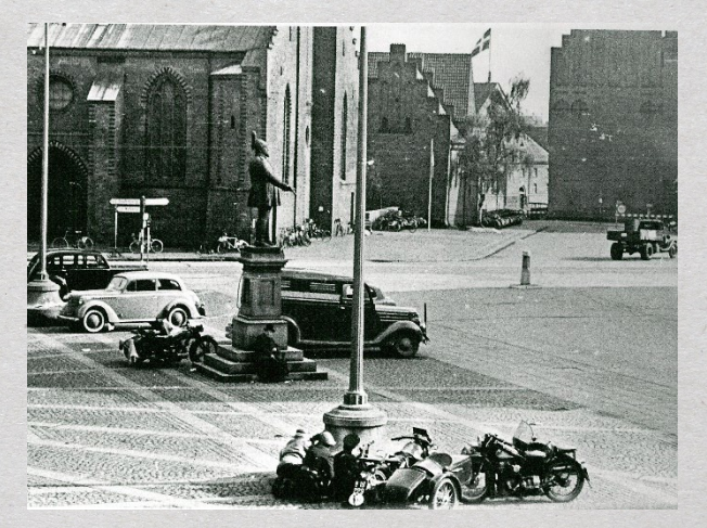
Members of the resistance movement in fight with German soldiers, 1945.

began their planned roundup, moving from house to house with prepared lists of victims, their knocks went mostly unanswered. All in all, 7,200 Jews were saved.