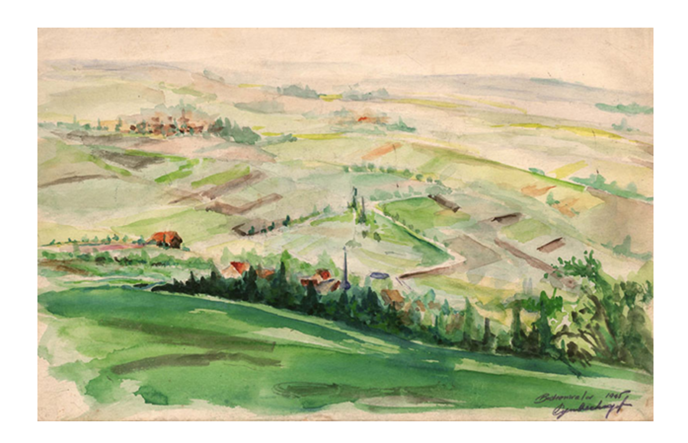
Jakob Zim (Cymberknopf), View of Buchenwald, a Few Days after Liberation, 1945. Watercolor on Paper.