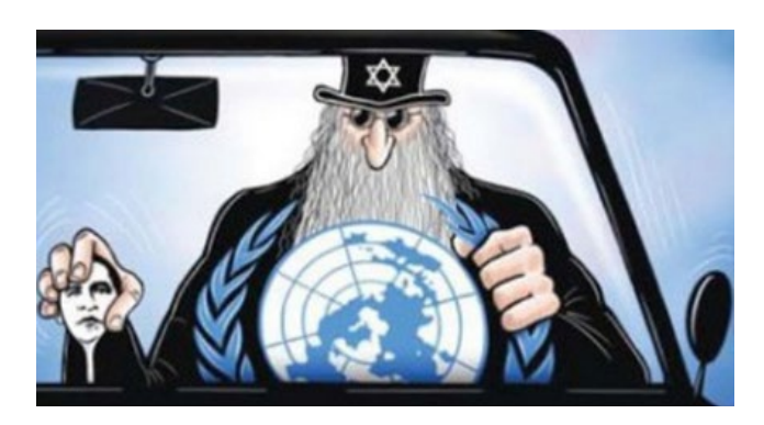
Cartoon from Al-Watan newspaper (Qatar), September 2011

According to ADL and other sources, the country of Qatar has funded academic institutions and news organizations while frequently utilizing its own media to demonize Jews through cartoons that cross the line from legitimate criticism of Israel or its policies into overt antisemitism. This cartoon features a picture of a stereotypical-looking observant Jew driving a car while holding President Obama's head in one hand like a stick shift and a steering wheel in the other fashioned out of the United Nations' logo. The image evokes classic antisemitic myths of Jewish control, in this case of the U.S. government and the UN.