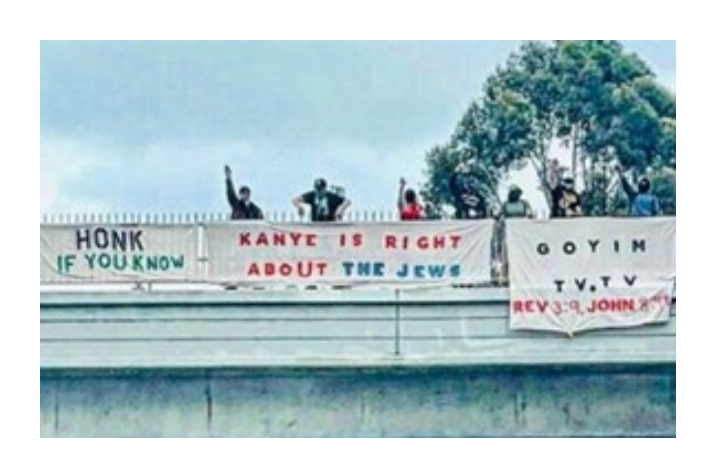
The Goyim Defense League, an American antisemitic hate group, hung banners supporting Kanye "Ye" West's comments about Jews over a Los Angeles bridge, Oct. 22, 2022.

As COVID-19 spread throughout the world in late 2019 and early 2020 forcing lockdowns in the United States and other countries, a wave of antisemitic conspiracy theories flooded the internet, blaming the Jews for spreading the deadly virus. These actions followed a similar pattern of blaming the Jews for the illnesses of the world, including the classic tropes of Jews poisoning the well or spreading the bubonic plague.