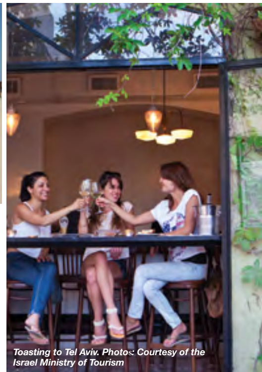
Toasting to Tel Aviv.

Outside the city walls, do not miss the Machane Yehuda Market, a culinary and anthropological experience in and of itself. And we haven't