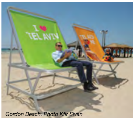
Gordon Beach.

Visit the Western Wall and discover its underground tunnels; and tour the Tower of David (located in a medieval citadel near Jaffa Gate), a 4,000 year old restored archaeological site showcasing Jerusalem's story. Follow in the footsteps of Jesus down the Via Dolorosa and the 14 Stations of the Cross; and visit the Church of the Holy Sepulchre, the sacred site of Jesus' crucifixion, burial and resurrection and a place of pilgrimage and worship since the fourth century.