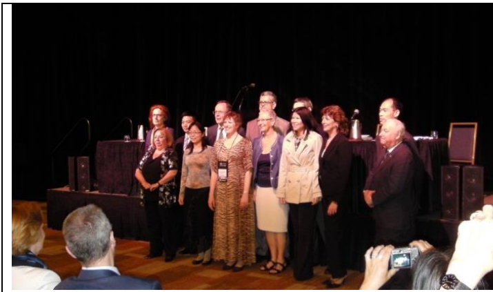
XIX FIT WORLD CONGRESS FIT COUNCIL FOR 2011-2014