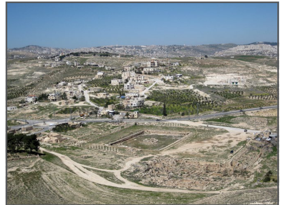
Lower Herodium and Za'tara