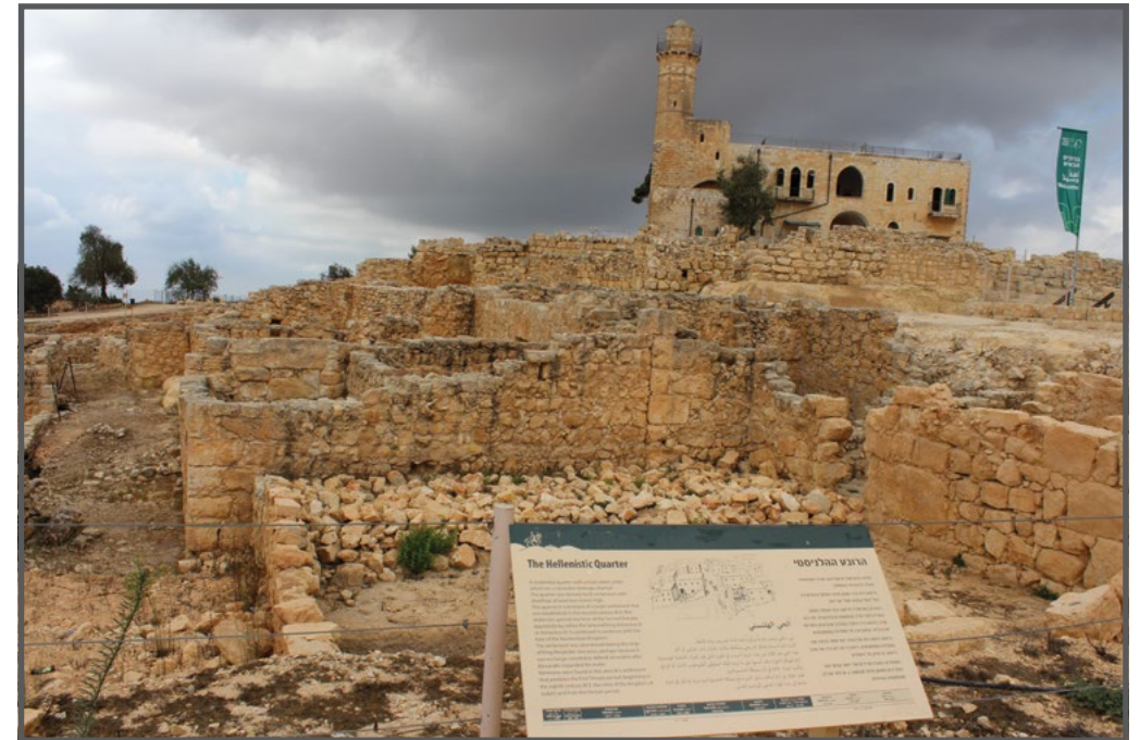
Nabi Samuel site today

The national park also violates the right to freedom of religious worship. According to the Law for the Preservation of Holy Sites (Article 1), the Nature and Parks Authority is required to allow free access to the mosque located on the site. Residents of the village pray at the mosque, but since the construction of the separation barrier between Nabi Samwil and the villages of al-Jib and Bir Nabala, there has been a sharp decline in the number of worshipers. Without a permit, residents of the villages located beyond the barrier are prevented from reaching the mosque. At the same time, the Ministry of Religious Affairs invested NIS 7 million in renovations and infrastructure for the benefit of those who visit the Tomb of the Prophet Samuel. Most of the investment is aimed at increasing Jewish tourism to the site 8 on special occasions such as the hillula - the commemoration of the Prophet Samuel, which takes place in the month of May (or thereabouts, depending on the Hebrew calendar). During the three days of the hillula , the village is closed to Palestinian non-residents, while the locals are forced to coordinate entering and exiting the village with the Civil Administration. 9