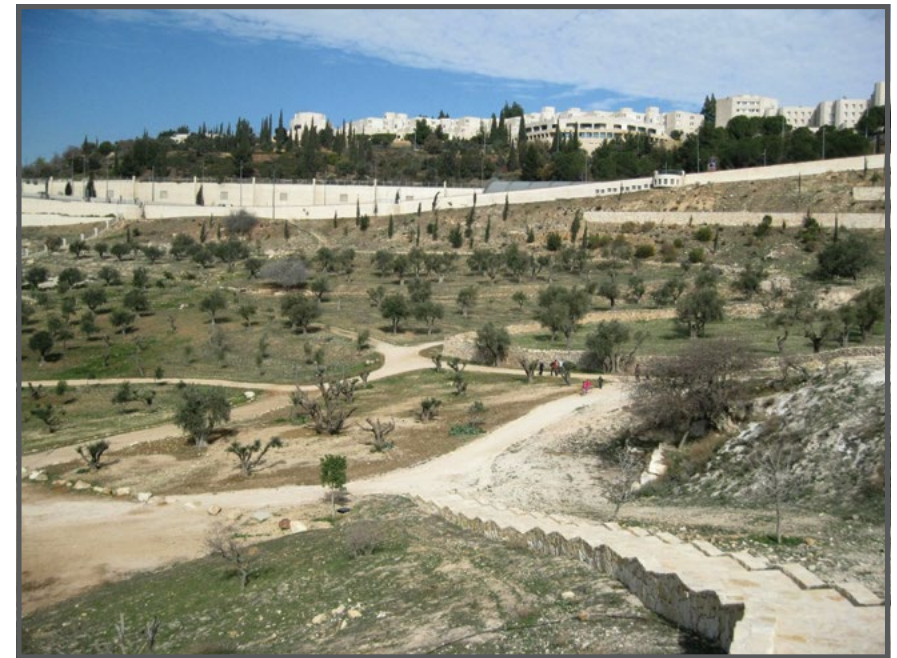
Emek Tzurim Valley and the Hebrew University