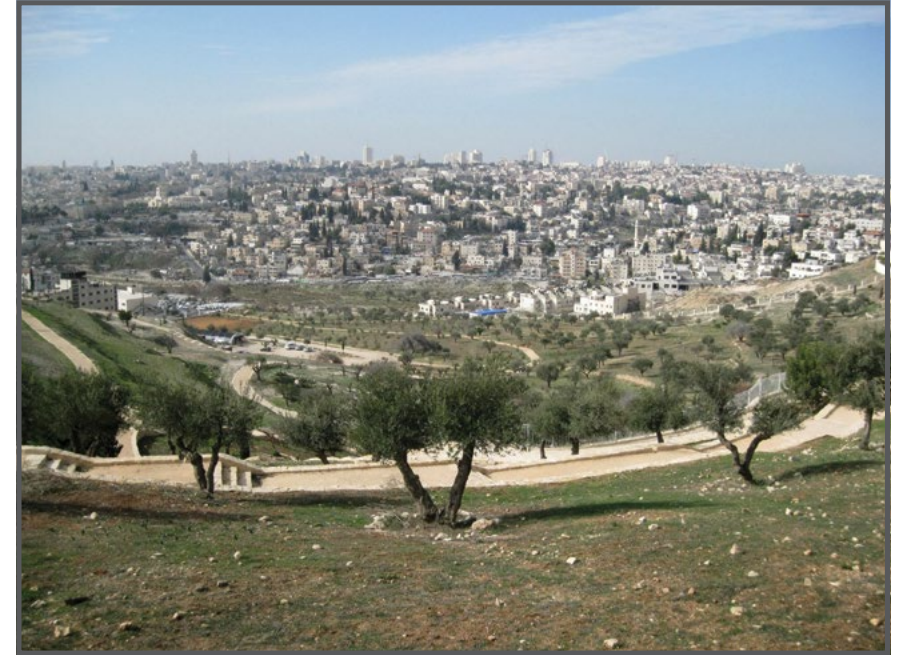
Emek Tzurim valley - view to the south-west of Palestinian neighborhoods, followed by Israeli neighborhoods

The absence of public spaces and the potential for leisure and cultural activity: Urban spaces in Israel and around the world include areas and buildings that serve as cultural, sport, and recreation centers. In the neighborhoods of West Jerusalem there are community centers, playgrounds, playing fields, movie and theater halls, pools, etc. The Emek Zurim National Park has eliminated the few remaining public areas in the neighborhood. In the vicinity of the national park is a playground that was used by the students of the nearby school and by the residents of the neighborhood, but in 2011 the Nature and Parks Authority claimed that the playground was located within the national park and accordingly demolished the fence that surrounded the lot repeatedly. It ceased doing so only after it was proven in the High Court that the plot is in fact located outside the area of the national park. By comparison, in the Yemin Moshe neighborhood in West Jerusalem, which is also located within the Jerusalem Walls National Park, the construction of a museum was permitted as was the expansion of the Jerusalem Cinematheque. 14