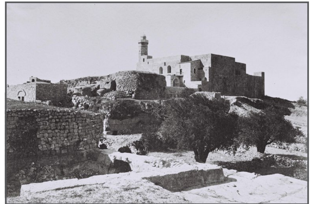
Nabi Samwil, 1910