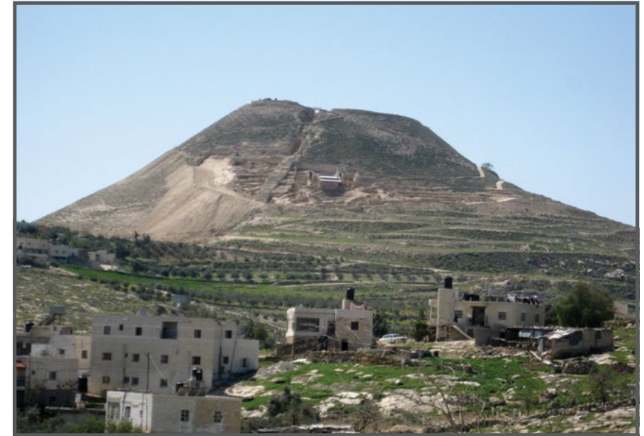
Herodium and Za'tara

breakfasts and other attractions, all located in nearby Jewish settlements. There are no Palestinian workers at the site.