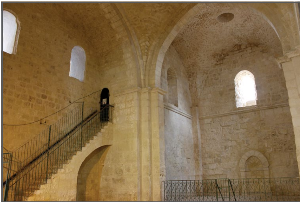
Interior of the mosque following renovations